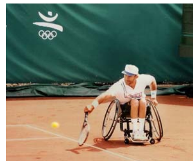
Brad Parks (USA) at 1992 Olympics

The International Tennis Hall of Fame's Class of 2010 Induction Ceremony will be held on 10 July in Newport, Rhode Island. For further information, visit www.tennisfame.com .