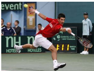
Novak Djokovic (SRB)

World No. 2 Novak Djokovic will look to lead Serbia to its first-ever World Group victory in an intriguing tie against 2007 champions USA in the 20,000-capacity Belgrade Arena. Djokovic is joined by Victor Troicki, Janko Tipsarevic and Nenad Zimonjic in a strong home line-up, while John Isner will make his debut for the United States alongside Sam Querrey and the experienced pairing of Bob and Mike Bryan.