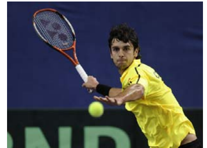
Mario Ancic (CRO)

This is Ancic's second ITF Pro Circuit event of 2010, after making his first Circuit appearance in nine years in Germany at the beginning of February, a return that was cut short by injury during his second round match. The Croatian, who was a member of his nation's Davis Cup winning team in 2005, has seen his ranking drop to No. 477 after suffering from mononucleosis in recent years. For further information, visit www.itftennis.com/mens .