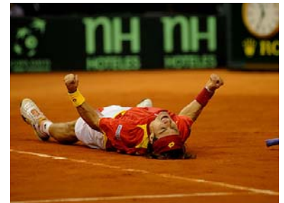
David Ferrer (ESP)

The Spanish team is led by David Ferrer, who won all six Davis Cup rubbers in 2009, for its tie against Switzerland indoors on clay in Logrono. The 27-year-old, who warmed up for Davis Cup by winning last week's clay court event in Acapulco, is joined by Tommy Robredo, Nicolas Almagro and Marcel Granollers in the home-team line-up. Switzerland is led by Stanislas Wawrinka as the visitors bid to end a four-match losing streak against the defending champions.